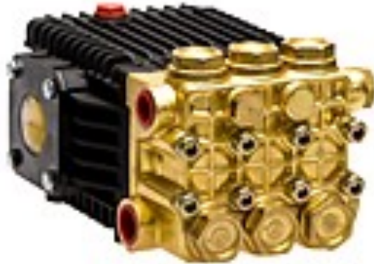
57058 REPLACEMENT BARE PUMP for PUMP MODEL 50099-HDE

Please contact Advanced Misting Systems for service or replacement parts.