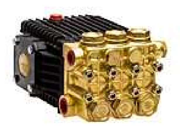
57058 REPLACEMENT BARE PUMP for PUMP MODEL 50099-HDE 57060 REPLACEMENT BARE PUMP for PUMP MODEL 50100-HDE—50200-HDE

Please contact Advanced Misting Systems for service or replacement parts.